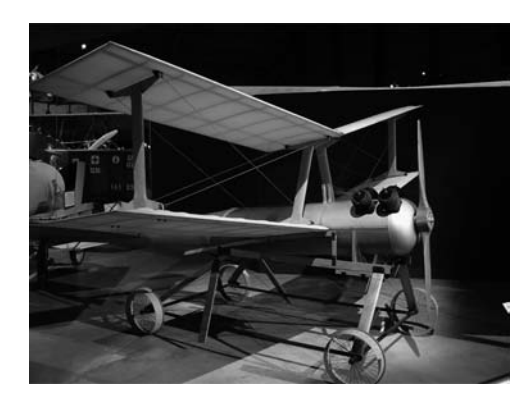
Figure 1.10. Kettetring Bug.