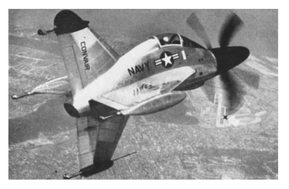
Figure 1.9. Convair XFY "Pogo". Courtesy of Aviastar [WOR 11]

many design and operational problems, e.g. the pilot had to look over his shoulder to properly stabilize the aircraft for landing. Also, it is considered that the XFV and the XFY VTOLs did not contribute to the development of modern VTOLs. Nowadays, there are many efforts to improve actual designs of helicopters and airplanes, to make them more stable, more reliable, more comfortable, etc.