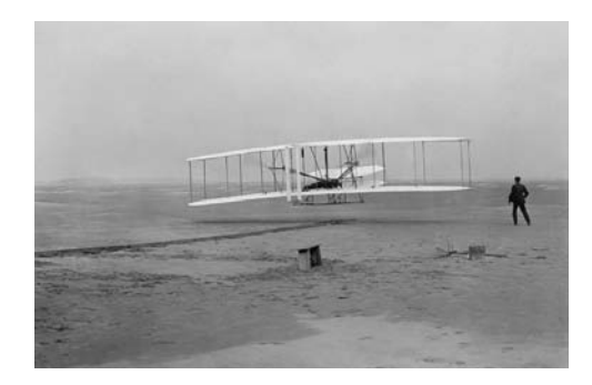
Figure 1.6. Wright brothers first flight.