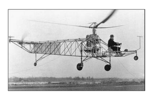
Figure 1.8. Sikorsky VS-300. Courtesy of Aviastar [WOR 11]

During and after World War I (WWI) there was an explosion in helicopter and airplane development all around the world. A more recent type of aircraft is the tailsitter which is an aircraft capable of vertical takeoff and landing (VTOL) as well as being capable of flying as a classic airplane. After WWII, in 1951, Lockheed and Convair were awarded the contract by the US Army and the US Navy to build the XFV (also referred as "Salmon") and the XFY (also known as "Pogo"), tailsitters. Figure 1.9 shows a Convair XFY-1 tailsitter. This concept of VTOL was abandoned due to