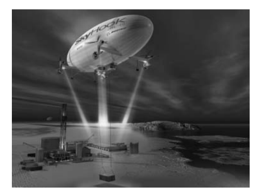
Figure 1.2. SkyHook heavy lifter vehicle.

Heavy and/or large load transportation vehicles such as the Helistat and the Skyhook projects that combine features of a blimp and a quadrotor helicopter. The Helistat was planned to be capable of carrying big loads for the US Forest Service. It consisted of a blimp and four Sikorsky Helicopters joined by a metallic structure. All the four helicopters were controlled by a human pilot. The Skyhook is planned to carry up to a 40 ton load with an operational range of 320 km without refueling. Figure 1.2 shows a virtual scene of a Skyhook carrying a heavy load in remote zone.