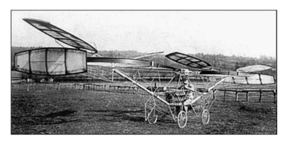
Figure 1.7. Cornu's hopper