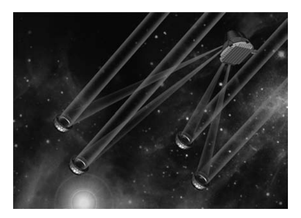
Figure 1.4. NASA's formation flying for which the levels of precision are much tighter.

Spacecraft formation flying is an important project of the National Aeronautics and Space Administration (NASA) in its search for Earth-like planets. Figure 1.4 shows a virtual image of a scheme of multiple spacecraft formation. A spacecraft formation requires a tighter level of precision, slower displacements, and automated control rather than human control.