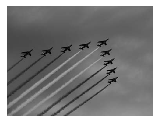
Figure 1.1. Aircraft formation flying

experiences on pilots. In Figure 1.1 a group of nine aircraft is shown doing a fly pass during the French Bastille Day Military Parade.